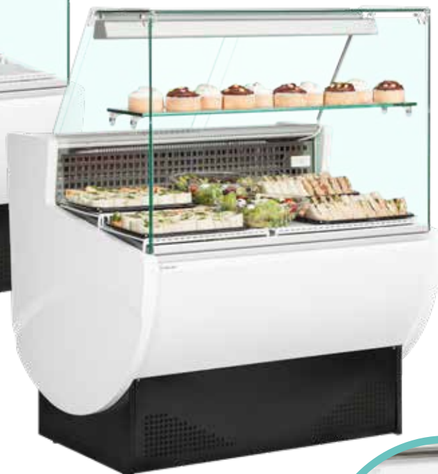
TAVIRA II 100F