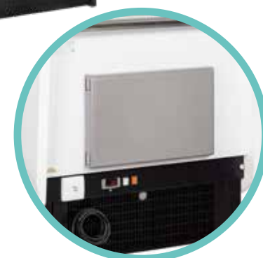
Understorage To Rear