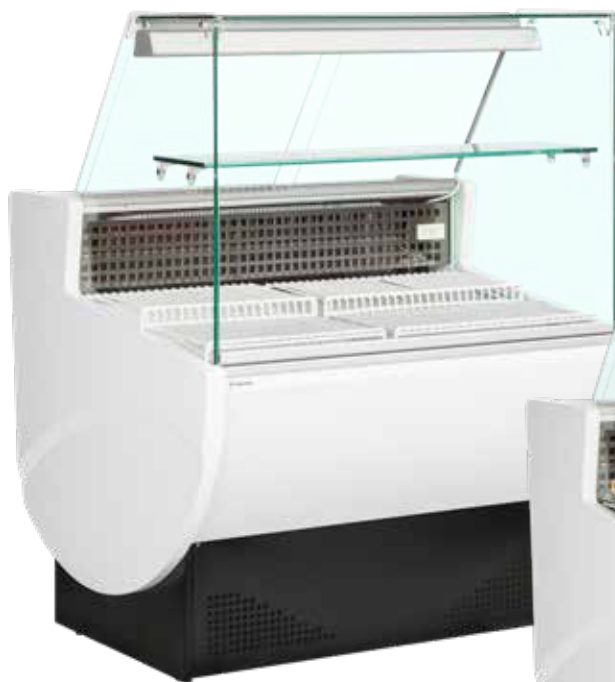
TAVIRA II 100F